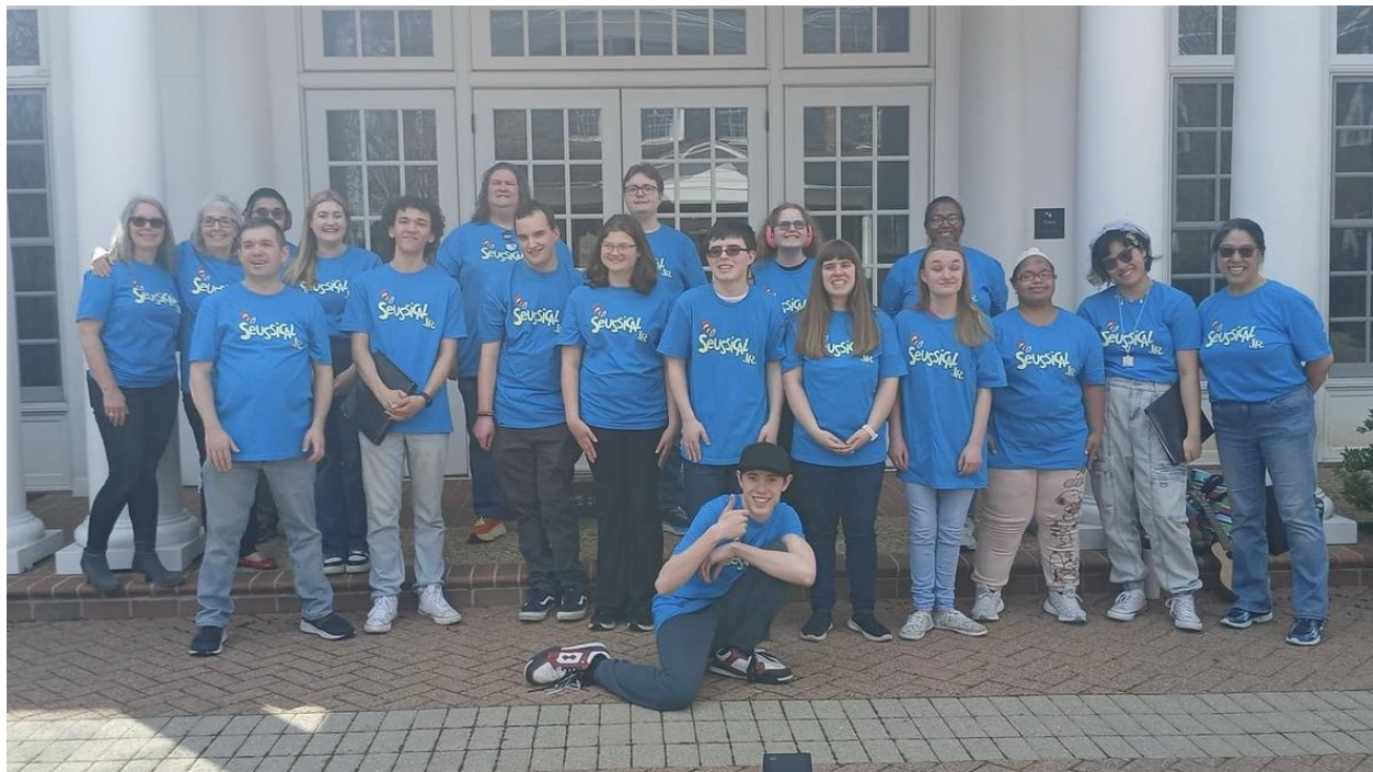
Figure 3. Seussical, Jr. cast performed for the board of the Virginia Commission for the Arts