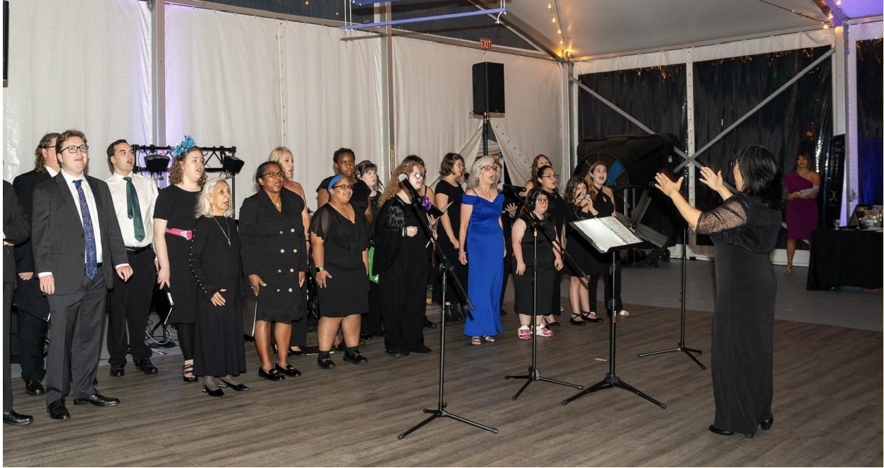
Figure 6. The STEP VA All-Abilities Choir performing at the Gala