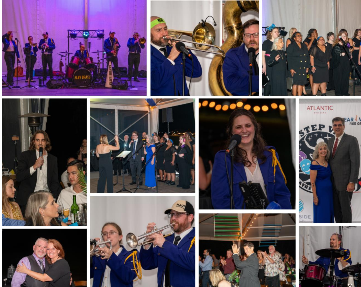
Figure 5. Scenes from the STEP VA Gala 2024