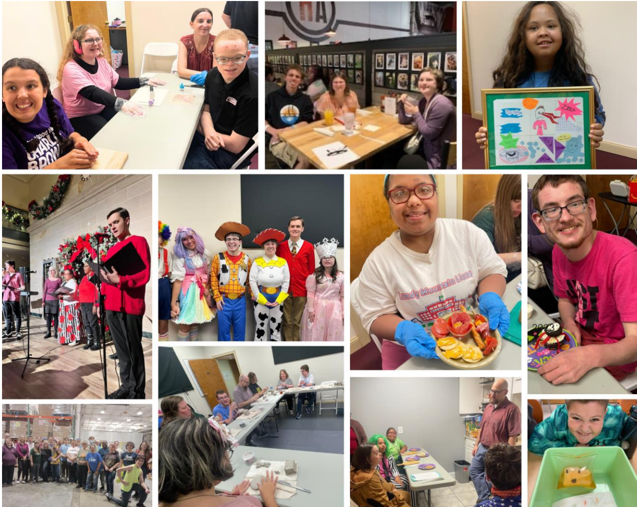
Figure 1. STEP VA in 2024