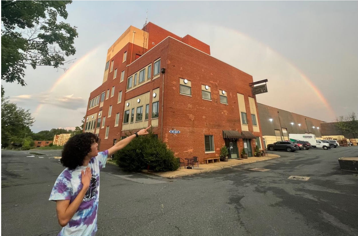
Figure 4 STEP VA intern points to a rainbow over our studio