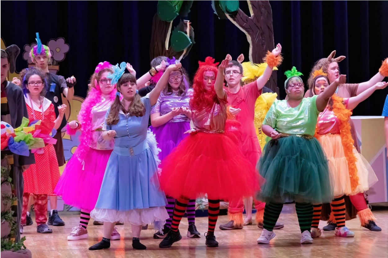
Figure 2. STEP VA's Seussical, Jr.